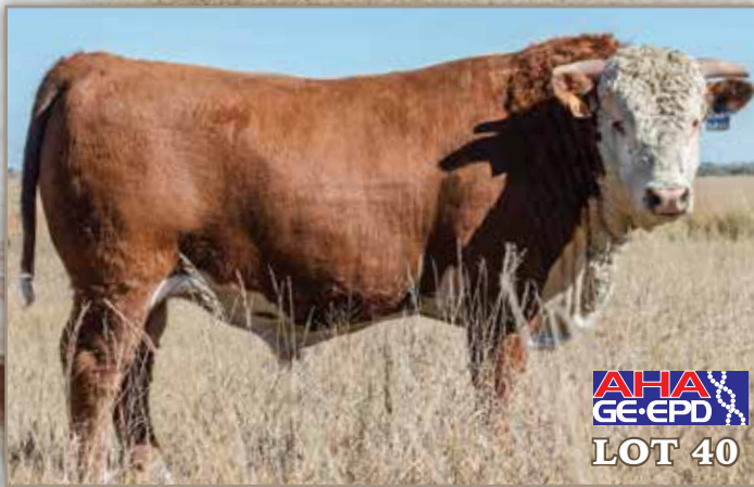
AHA GE-EPD LOT 40