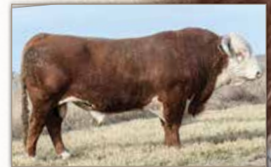
SR RENDITION 1433A