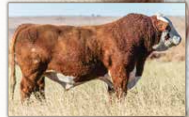
UU LAREDO 8479F