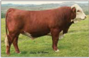
SR BAKKEN 62Z