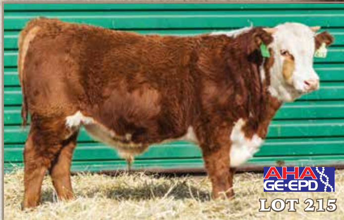
AHA GE-EPD LOT 215

Big strapping 9214 son form a Diablo-Sensation dam. He's fully pigmented with a teardrop, long barreled, and very easy to look at.