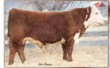
CL1 DOMINO 883F 1ET

CL 1 DOMINO 215Z #43268007 SIRE: CL 1 DOMINO 9122W 1ET | DAM: CL 1 DOMINETTE 055X CED 1.8 BW 2.2 WW 73 YW 113 MILK 28 M&G 64 REA 0.41 MARB 0.52 CHB 183 3 SONS SELL. Breed-leading, curve-bending sire. Top of the line carcass with elite females!