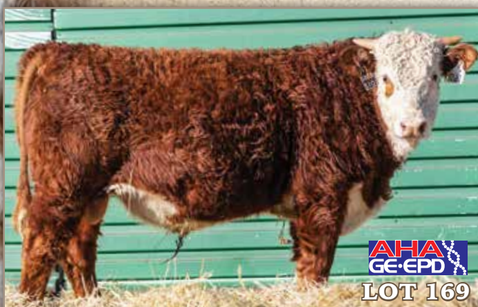
AHA GE-EPD LOT 169

Long made, curve bending 6187 son from one of our top 11X cows. He's fully pigmented, strong topped, long hipped, with a slug of substance and mass, and a huge rear end.