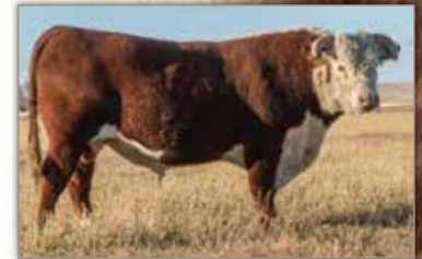
UU STERLING 7007E