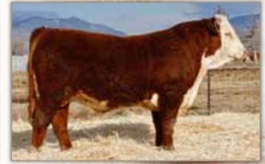
HH ADVANCE 7156

UU KINGSLEY 7241E #43790215 SIRE: UU SENSATION 4025 | DAM: UU MS BAKKEN 5098 CED 0.8 BW 2.0 WW 69 YW 110 MILK 40 M&G 75 REA 0.81 MARB 0.45 CHB 159 34 SONS SELL. Used as a heifer bull with good results. Curve bending figures with tremendous carcass. Very athletic pasture sire.