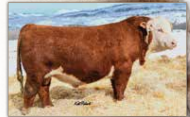
CL1 DOMINO 942G