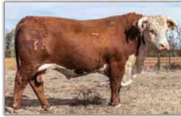
CL 1 DOMINO 6187D