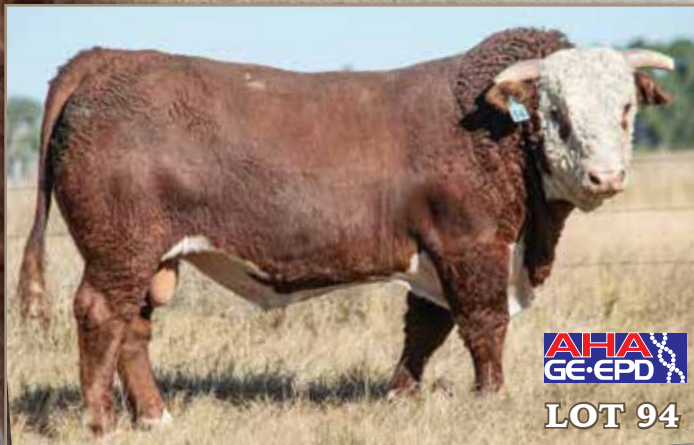
AHA GE-EPD LOT 94

Extra calving ease 6148 son from a top Sensation first calf heifer. Fully pigmented, with smooth shoulders, big butt, and added length and marbling.