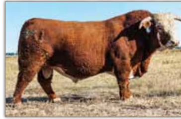
UU KINGSLEY 7241E