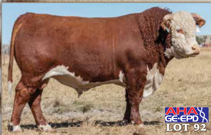
AHA GE-EPD LOT 92

Here's a thick made Kingsley son that is very easy to look at. He's fully pigmented, with a tear drop, moderately framed, with a ton of carcass merit bred in. Grand dam is an AHA Dam of Distinction.