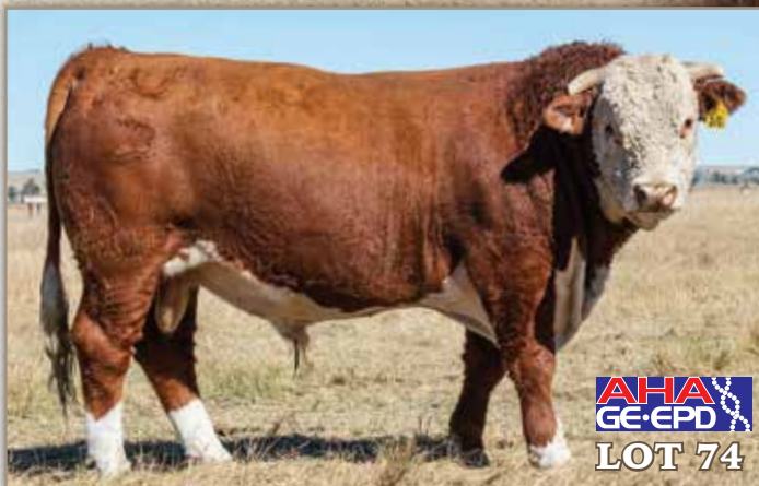
AHA GE-EPD LOT 74

Here's a thick made Laredo son. Fully pigmented, stands out on all 4 corners, with a very moderate frame, and extra thick from end to end. Grand dam is an AHA Dam of Distinction.