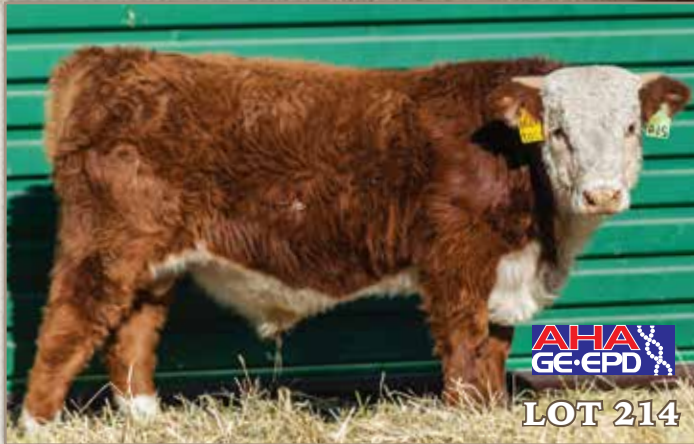
AHA GE-EPD LOT 214

Here's another Kingsley BRICK. Big time performance, and carcass figures. This guy is stout made, fully pigmented, and busting at the seams with muscle. Grand dam is an AHA Dam of Distinction.