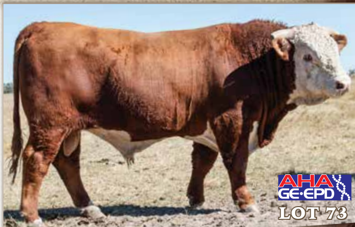
AHA GE-EPD LOT 73

Another easy on the eyes Rendition son. Solid marked, fully pigmented, he's easy fleshing, and stout made. Dam is an AHA Dam of Distinction.