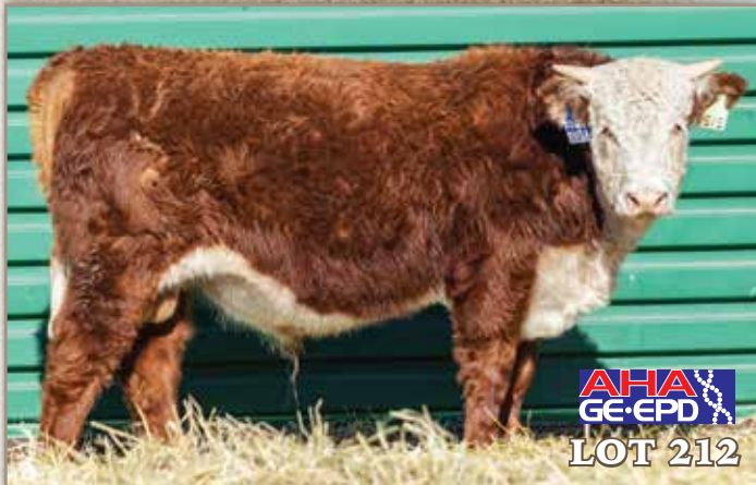
AHA GE-EPD LOT 212

A little more frame here. Well-made 942 son, from a top Bakken daughter- out of a great cow family. He's fully pigmented, big sided, and extra-long hiped. Two Grand dams are AHA Dams of Distinction.