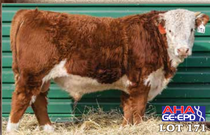
AHA GE-EPD LOT 171

Curve bending 6187 son with slugs of substance and guts. Fully pigmented, correct in his structure, with a strong straight back, and oh so easy to look at.