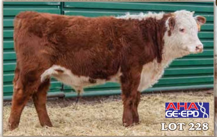
AHA GE EPD LOT 228

Another easy to look at 6187 son, from a top producing cow family. He's long made, fully pigmented, deep sided, and casts a great profile. Grand dam is an AHA Dam of Distinction.