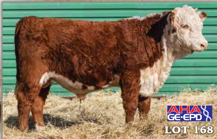
AHA GE-EPD LOT 168