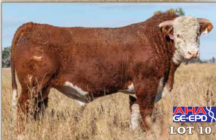
AHA GE-EPD LOT 10

Same song second verse, yet another long, thick made Bakken. Fully pigmented, deep made through his rib and flank, and carries around a huge rear end. Grand Dam is an AHA Dam of Distinction.