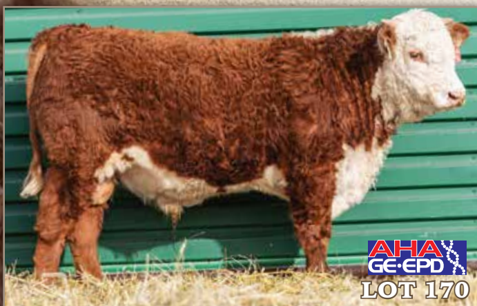
AHA GE-EPD LOT 170

Thick made rascal from our new sire-942, and one of our top cows. This guy is deep made, heavy boned, pigmented, with a ton of substance and mass. Dam and Grand dam are AHA Dams of Distinction.