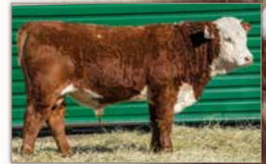
UU HULETT 9206G