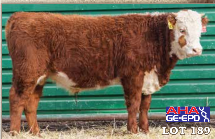
AHA GE-EPD LOT 189

Here's a curve bending 9206 son from a real top cow line. Fully pigmented with a tear drop, upstanding, extra-long made, with a ton of substance and volume. Dam and Grand dam are AHA Dams of Distinction.